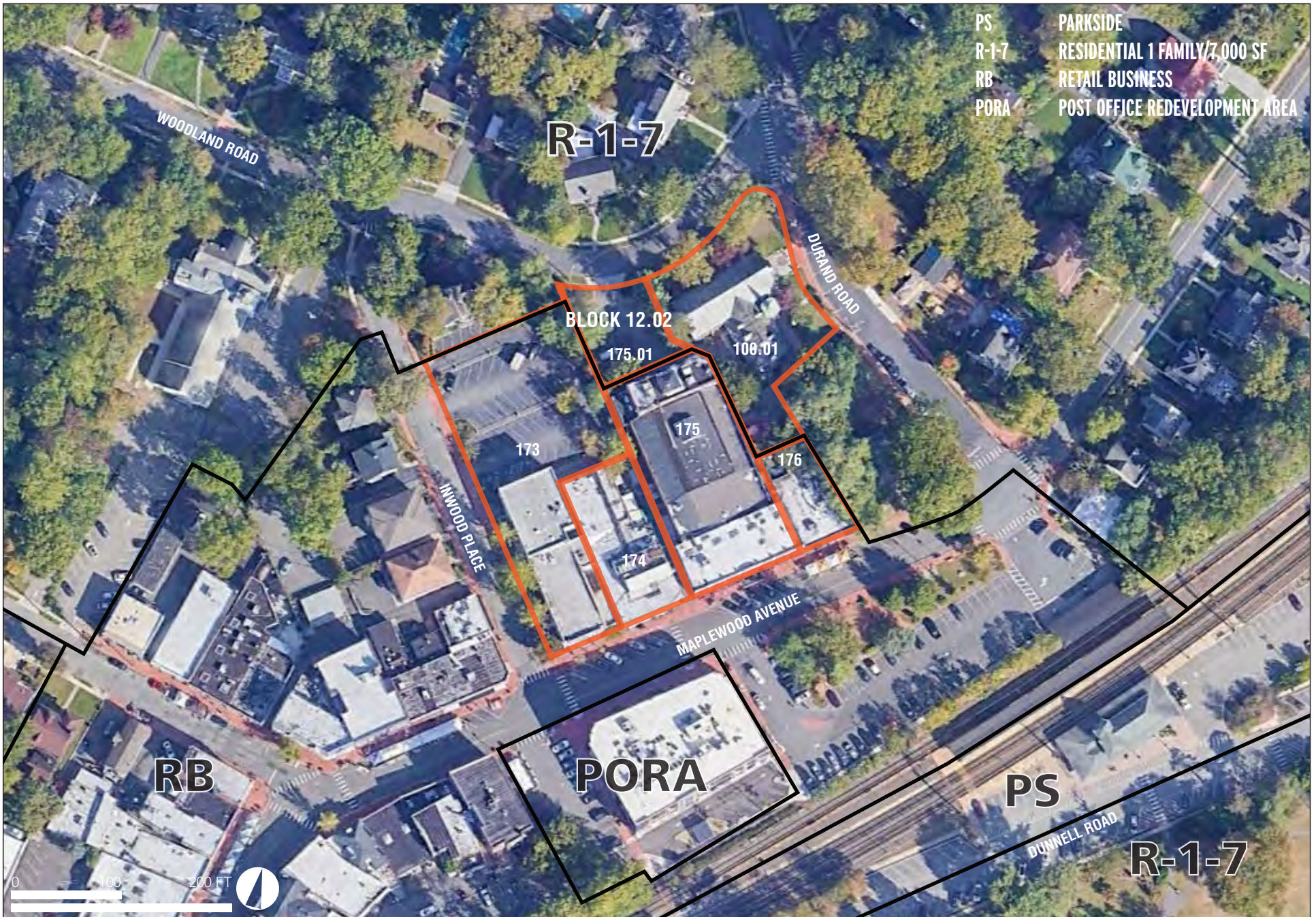
FIGURE 3: EXISTING ZONING

BLOCK 12.02 REDEVELOPMENT PLAN | TOWNSHIP OF MAPLEWOOD, NEW JERSEY PHILLIPS PREISS GRYGIEL LEHENY HUGHES LLC 2024